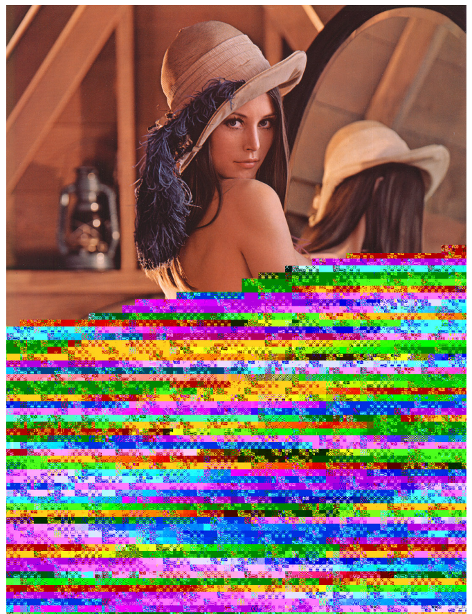
Lena Söderberg, from the 1972 issue of Playboy; here printed from a corrupt JPEG file with bad Huffman code without permission.