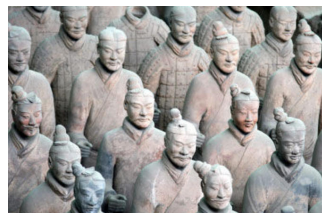
Curse of powerpoint as experienced by the soldiers. Bless their innocence...

As a huge fan of quantum physics, he was frequently misunderstood by contemporaries. How-